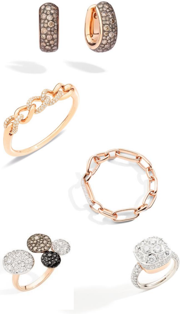
Aubrey Plaza chosen to wear Pomellato Jewelry: Iconica earrings, Iconica and Catene bracelets, Sabbia and Nudo rings