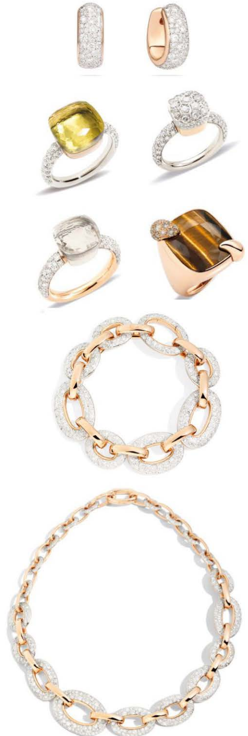
Hadia Ghaleb, wearing Pomellato jewelry