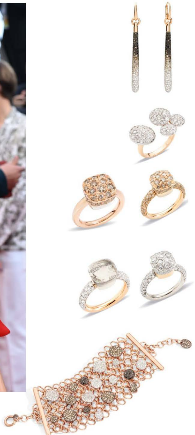
Thassia Naves, wearing Pomellato jewellery