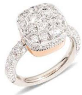
Valeria Golino, wearing Pomellato jewelry